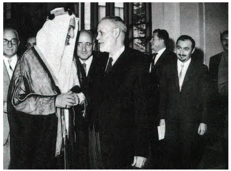
Meeting with King Faisal ibn Abdul-Aziz (1906 to 1975) of Saudi Arabia—in appreciation of his outstanding services to the Muslim Ummah, the government of Saudi Arabia granted Muhammad Zafrulla Khan the privilege to pray inside the holy structure of the Ka'bah itself.

Every moment of my stay in New Zealand proved most enjoyable and full of delight. From New Zealand I flew to Sydney and spent three very interesting days in Canberra.