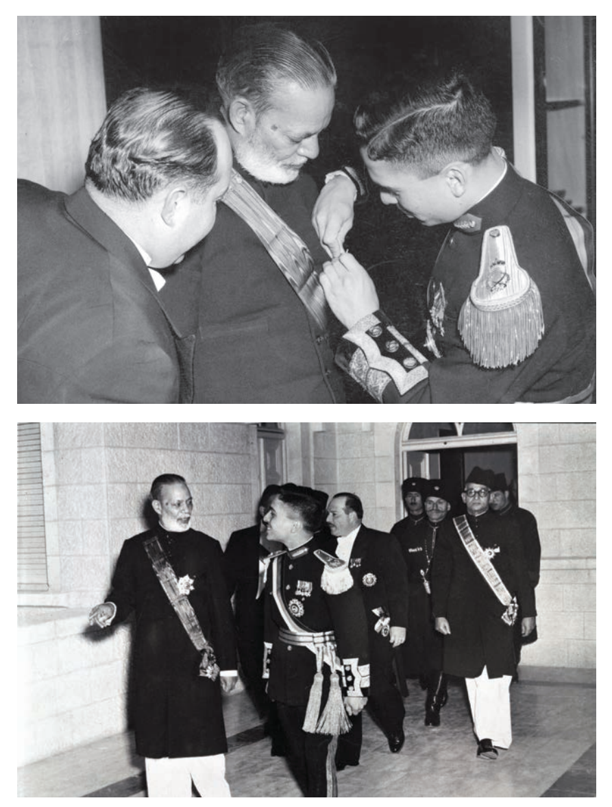
In recognition of his exceptional services for the cause of Palestine, Khan was decorated with the highest honour by King Hussein bin Talal (1935 to 1999) of Jordan.