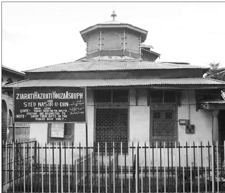
The Tomb of Jesus— Khanyar Street, Srinagar, Kashmir